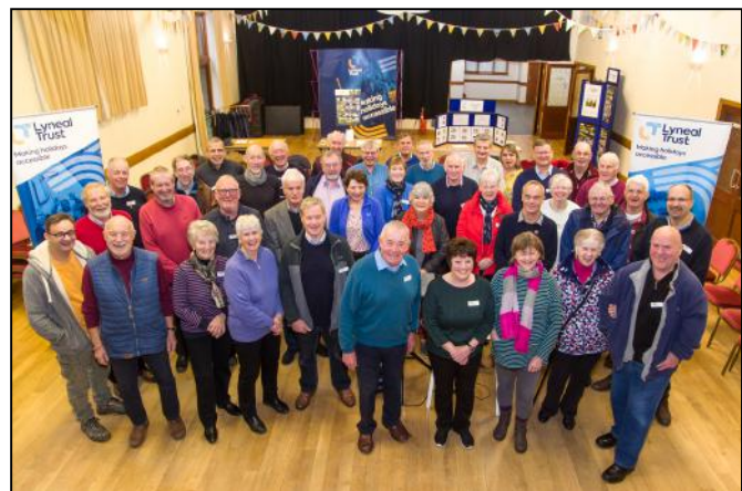
End of 2019 Season meeting attendees

Two formal volunteer meetings took place. The 'end of 2019 season' session covered a review of the season's performance, updates on volunteers' training, introduction of new policies and procedures and the announcement of Trust